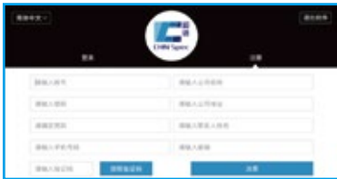
Intelligent instrument software, support operation without PC.