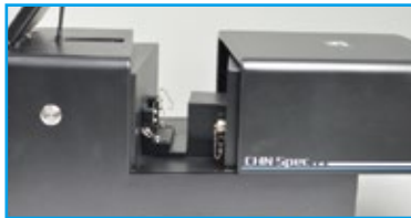
Open measurement area, no limit on sample size.