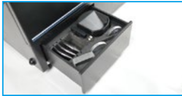
Perfect combination of accessories and instrument body , convenient for protection and storage.