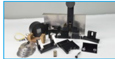
Different kinds of standard accessories and optional accessories to meet the measurement requirements of different materials.