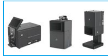
Instrument is with 7.0 inches TFT touch display screen with good human-computer interface.