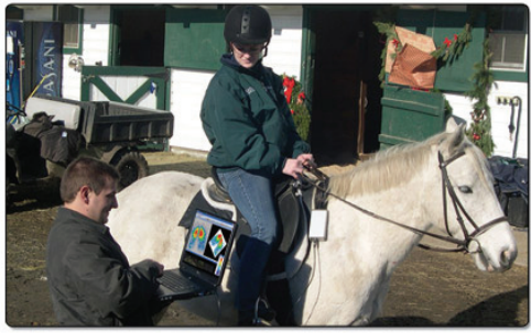
Characterization of surface pressure of a person on a horse saddle using the Tactilus Equestrics® Sensor System