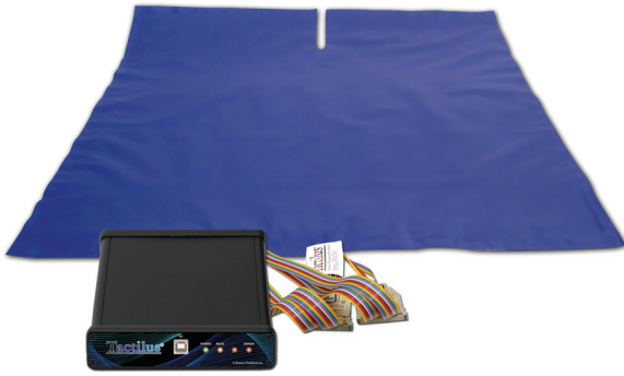
Sensor element and electronic components

spots, and help determine the most suitable saddle tree type, tree width, panel shape and depth for his back.